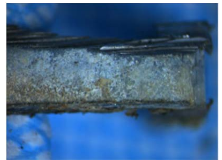
b. Facing edge, after 7 months' exposure to sea water

b. The Storm Greeter coating protected the facing edge of the steel. It did not delaminate.