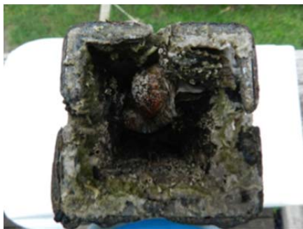
a. Fresh from the ocean

This cross-section on the left shows the accumulation of marine life inside the post. The coating was not penetrated or damaged by the barnacles and other crustaceans.