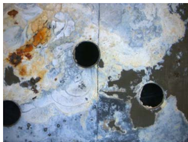
Figure 2: In order to hang the ecomère tie in the chamber, a hole was made in the coating. Because the coating would need to be removed at the end of the test, the steel was not primed as it normally would be. During the 3,072 hours in the chamber, salt water was able to accumulate inside the coating. The photos show that, even though the ecomère tie was in the salt fog chamber more than 3 times as long as the uncoated tie, with a hole in the coating, the amount of red rust is much less than on the uncoated tie, showing that the ecomère coating greatly reduced the damage done by the ASTM B117.